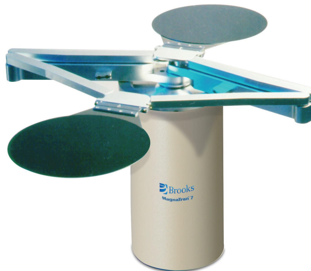
MAG7 B Robot Shown

The PASIV™ user programmable safety zones prevent possible collision during manual operation thus insuring the safety of high value wafers and process equipment. Comprehensive diagnostics are accomplished with a graphic interface at a remote, modem linked, service terminal. Error logging with prior events are time and date stamped. Cycle counters are in non-volatile memory and critical performance characteristics are monitored graphically. Multi-Sensor Interfacing is accomplished by high speed Digital I/O which enables a direct interface to substrate sensors and other peripheral modules such as valves.