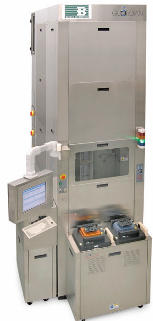
The Guardian Bare Reticle Stocker provides unprecedented levels of protection and safety for stored reticles.

The Guardian's I/O module contains reticle carrier openers for Nikon, Canon or ASML steppers. The module can "mix and match" opener types according to a fab's needs. All major carriers' ID systems can also be integrated into the I/O module.